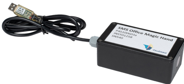
SMS Magic Hand™ office version

The sensor is designed and tested in accordance with ISO13628-6, API 17F.